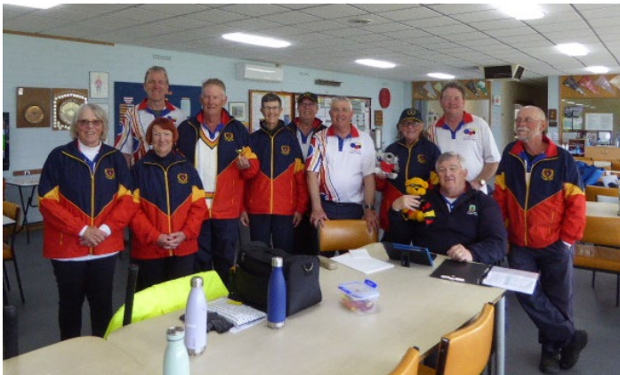
South Australia State GC Team who competed in Australian GC Championships Adelaide September 2022